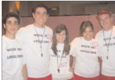
Student volunteers from the Class of 2006