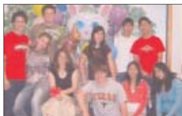
Make-A-Wish Club members at Healthbridge Hospital

Members of the Make-A-Wish Club spent a Saturday afternoon before Easter spreading Easter Joy to children at Healthbridge Hospital. The group decorated each of the hospital room doors and spent