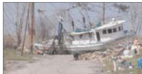
Many cars and boats have been moved to the side of the roads, this large boat still sits in the middle of a neighborhood street.

On day three they worked diligently at Our Lady of Prompt Succor Church which had water nearly to the door jam following the hurricane. Representatives from FEMA were on their way and the gym was in no shape to host them. So the Mater Dei group scrubbed floors, cleaned chairs and did some gardening to ready the facility.