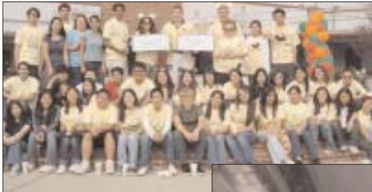
Key Club members along with representatives of SOS and Disney at the 2006 Health Fair

Most importantly, the health fair offered nutritional guidance and diabetes screenings for everyone in attendance. This is the first Health Fair the Key Club has hosted overall, the day was a huge success. The Key Club looks forward to teaming with SOS for future events and hopes the health fair will become an annual event.