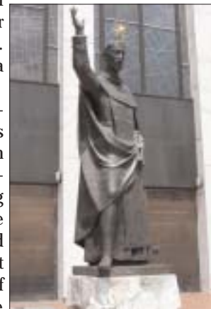
This statue sits about 4 feet above the ground and was covered in water past his knees

was both mentally and physically draining but the final day still arrived too quickly. Prior to heading to the airport, the hosts from St. Scholastica and St. Scholastica and the Mater Dei group shared in the greatest gift, The Mass. It was an emotional service that culminated with the singing of both the Mater Dei and the St. Scholastica Alma Maters.