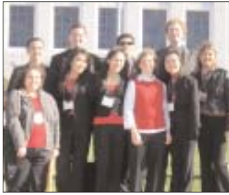
2005-06 Academic Decathlon Team

The results are in! For the first time in school history, Mater Dei High School won first place overall in the Southern California Private Schools Academic Decathlon, which took place in February at Bishop Alemany High School.