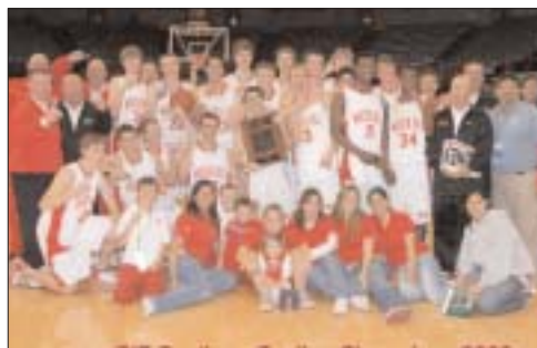
2006 CIF & Southern California Champions

The Monarchs were led by a well balanced attack and had a number of players earn individual honors. The jun-