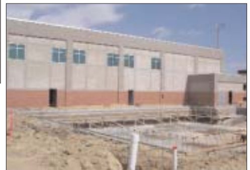
Looking southeast on the pool deck