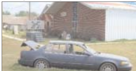
Although there is an abandoned car on the grass, the sign in front of this church around Easter read, "He Has Risen, and So Will We."

The relationship forged between Mater Dei High School St. Scholastica Academy and St. Paul's High School and has only grown stronger as the year has progressed. Although the memories of Hurricane Katrina may seem to have faded to people outside of the effected region, the signs of her destruction are still very evident in Covington, LA where these schools are located. Over the Easter Break, 17 MD students, eight adults and two future Monarchs took a five day service trip to Louisiana.