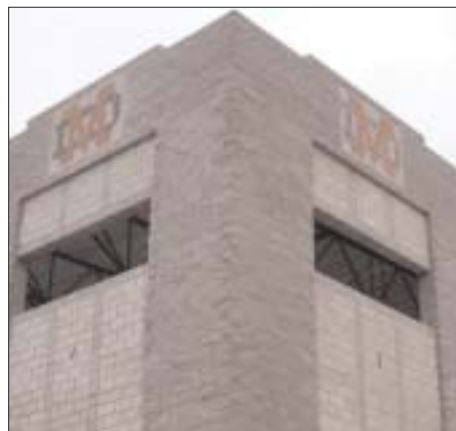
The MD logo is proudly displayed on both walls of the north east corner of the gym