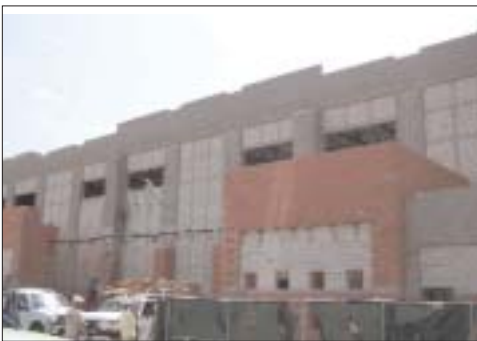
Looking southwest from the Monarch Way parking lot