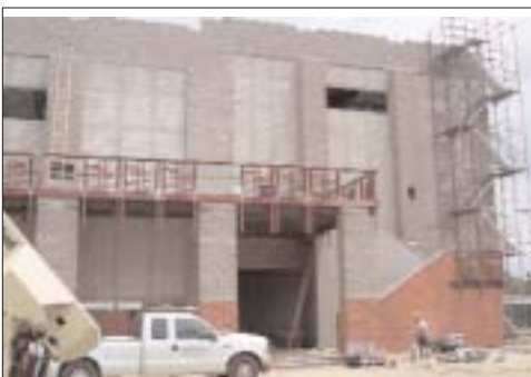
The southwest corner of the gym