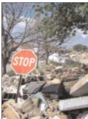
Debris is still piled as high as stop signs in some areas

Day two gave the Monarchs and their hosts a chance to interact with some local residents. They visited