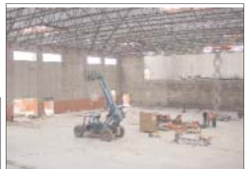
Looking southeast at the main court of the gym The upper right portion is the wrestling area